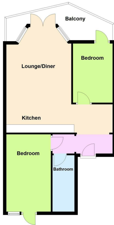
Total area: approx. 61.9 sq. metres (665.9 sq. feet)